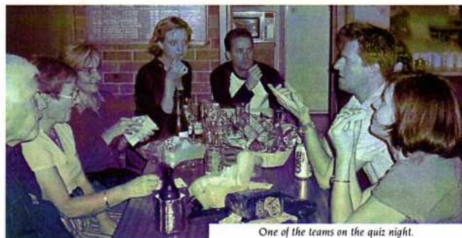
One of the teams on the quiz night.

Funds raised for the choir totalled just under $500.