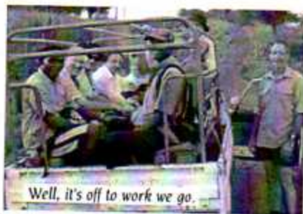
Well, it's off to work we go.

Work began in earnest and we built the house from the bearers and joists upwards. This was no mean feat as all the houses had to be the same size etc. The wood from which