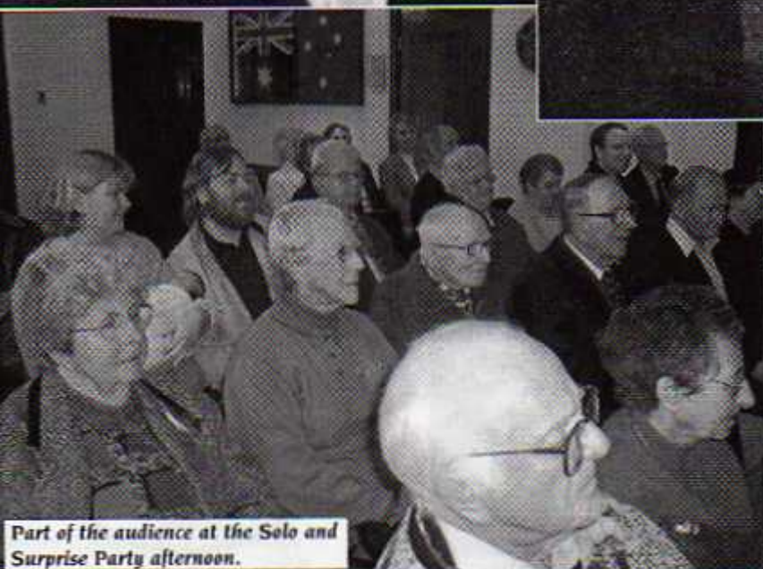
Part of the audience at the Solo and Surprise Party afternoon.