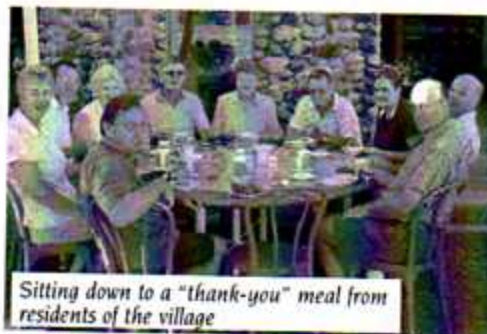
Sitting down to a "thank-you" meal from residents of the village

Other help appeared on the Sunday in the form of the Volunteers. These were the male residents who were expected to help with the construction (if they didn't help at all there was the threat of eviction from the subdivision - and there were plenty just waiting to take their place). The little boys of the subdivision were around during the weekends filling every possible hole with nails. (There was so much metal in the form of metal strapping and nails that should a cyclone hit the area the whole subdivision would resemble a scene from the Wizard of Oz). None of us have seen such a clean work site, for any timber off cuts or metal left on site in the afternoon were gone in the morning - the wood to act as fuel for their fires and the metal for home improvements.