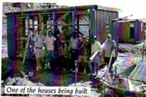
One of the houses being built.