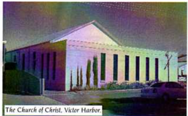
The Church of Christ, Victor Harbor.

Each choir sang two brackets of songs, with the Hamilton Choir starting off first and the Adelaide Male Voice Choir finishing the concert. There was quite a contrast in