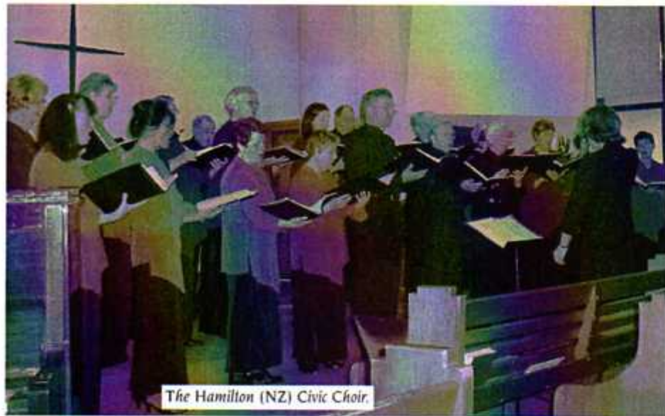
The Hamilton (NZ) Civic Choir.

styles, especially as the Hamilton Choir is mixed voice choir but this added to the enjoyment of the whole performance.