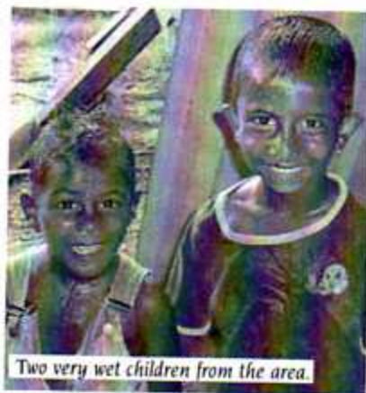
Two very wet children from the area.

was helping to build. There were a couple of other paid workers and they were under Saten's charge.