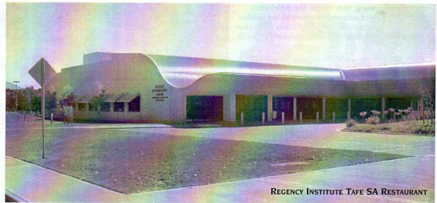
REGENCY INSTITUTE TAFE SA RESTAURANT

This promises to be one of the highlights of the choir's year.