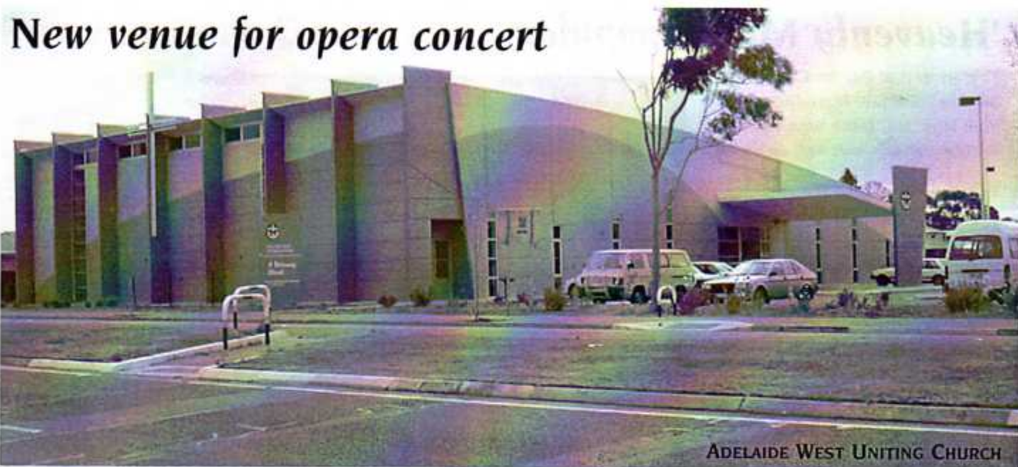
ADELAIDE WEST UNITING CHURCH

This is where the Adelaide Male Voice Choir will perform the Opera concert on Sunday, 19th October, at 2 pm. It is a new venue for the choir and one which the audience will appreciate. The Uniting Church sold three of their