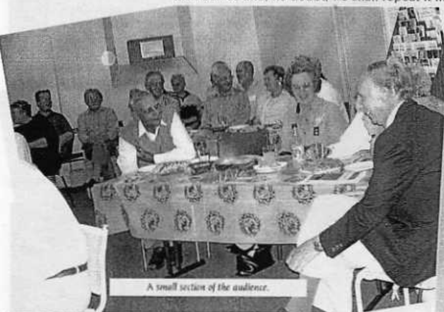
A small section of the audience.