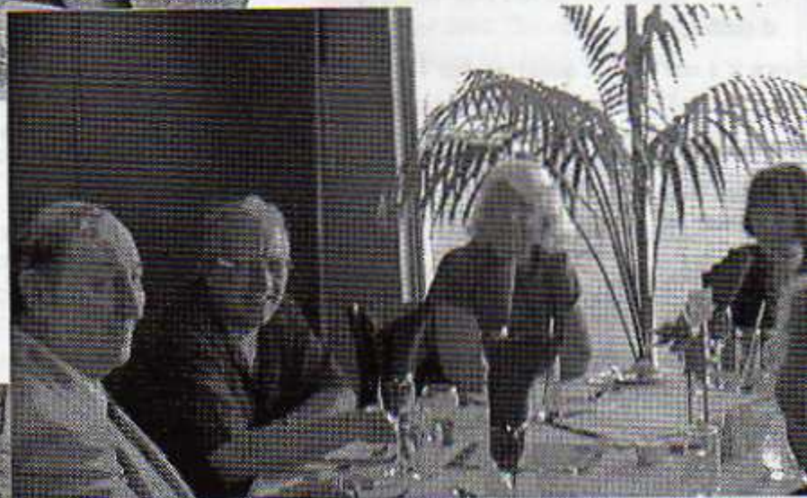
Below: Not so good in black and white but the evening was enhanced by a glorious sunset.