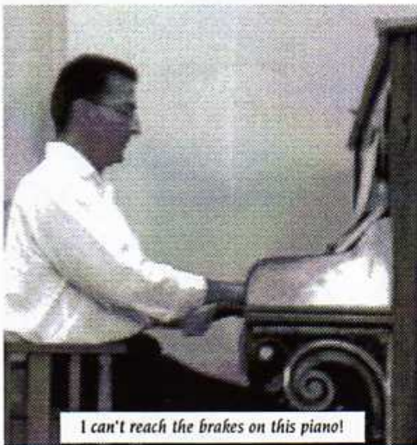
I can't reach the brakes on this piano!

The concert at Milang on Sunday, 14th April, was enjoyed by all. The weather was perfect and the hosts were very welcoming.